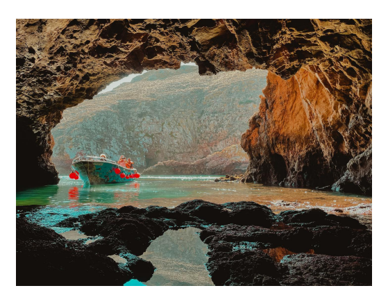
Excursion to The Berlengas and cave tour in a glass bottomed boat.

Excursion to Europe's biggest sculpture park the Buddha Eden which includes transport there and back and the ticket to get in!